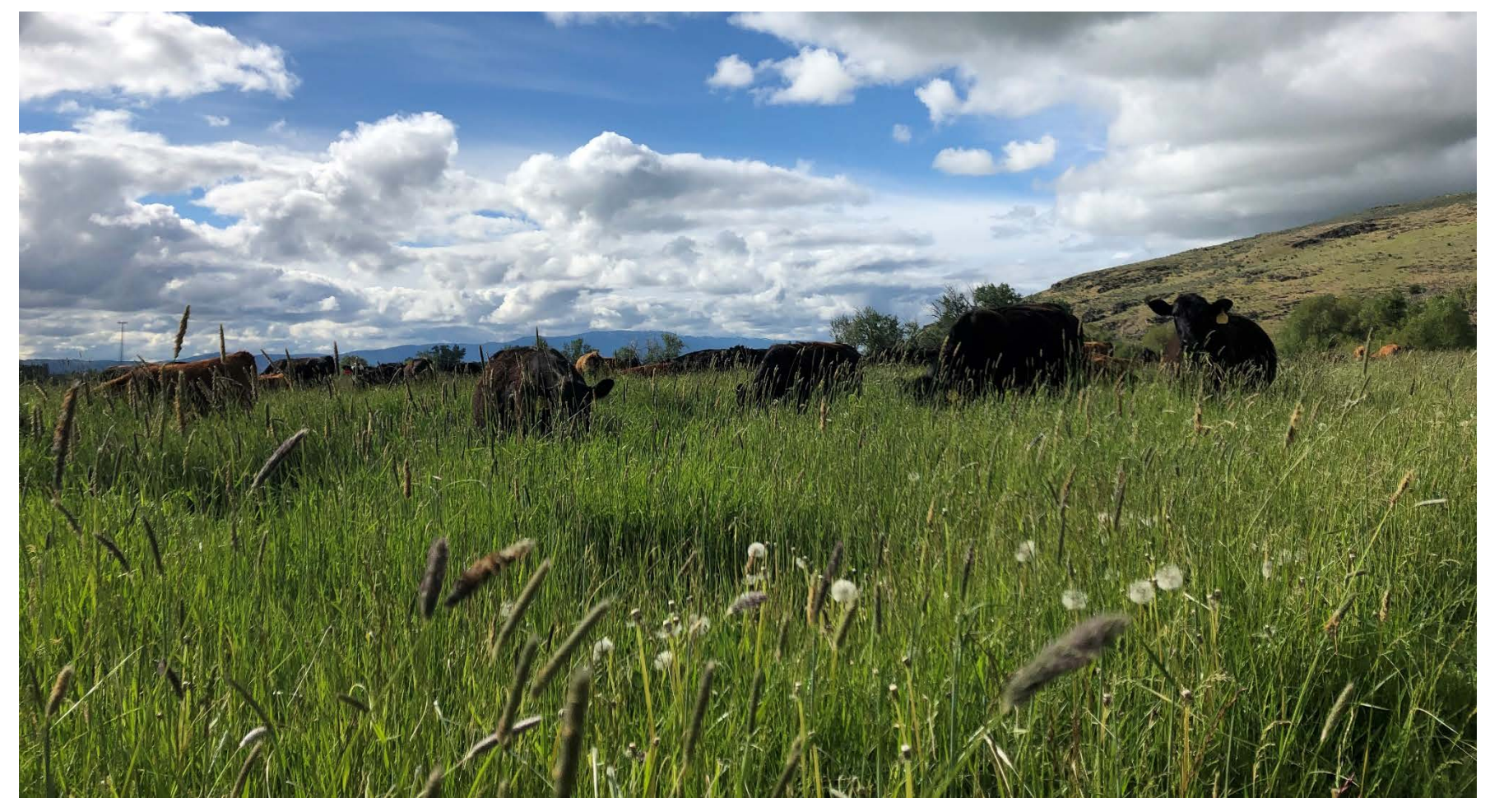
Buffalo Flats Planning Area

Catherine Creek supports Chinook salmon, steelhead, and bull trout populations that are listed as threatened under the Endangered Species Act. For Chinook salmon, 20 years of collected data indicates that spawning areas are focused in Catherine Creek from the city boundary of Union, Oregon upstream to the confluence of the North and South Forks, with the highest density of spawning within the Hall Ranch (ODFW Research). A majority of the creek surveyed upstream of Union in the 2011 was found to be in poor condition for fish because it is dominated by riffle habitat and lacking pools and cover. The lack of flow downstream of Union also limits salmon from spawning as discharge is reduced by as much as 76% for irrigation use. The Buffalo Flats project area is located in a portion of Catherine Creek deemed the most critical reach for fish habitat restoration (GRMW ATLAS Process).