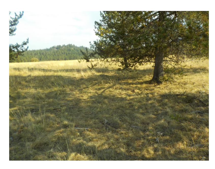
Proposed Trough Location

Currently the District is working on a Spring Development and a Forest Thinning grant.