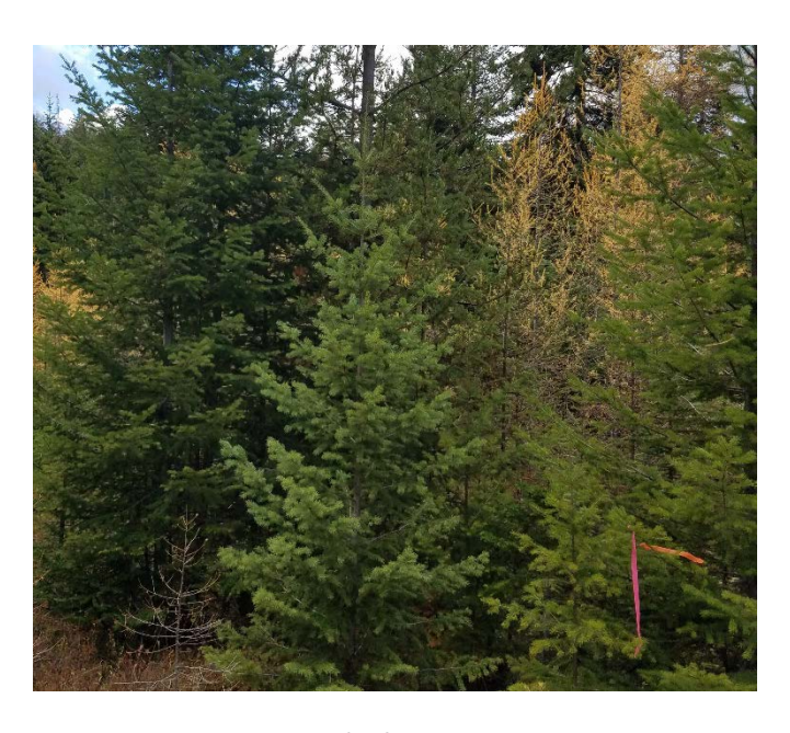
Proposed Thinning Area