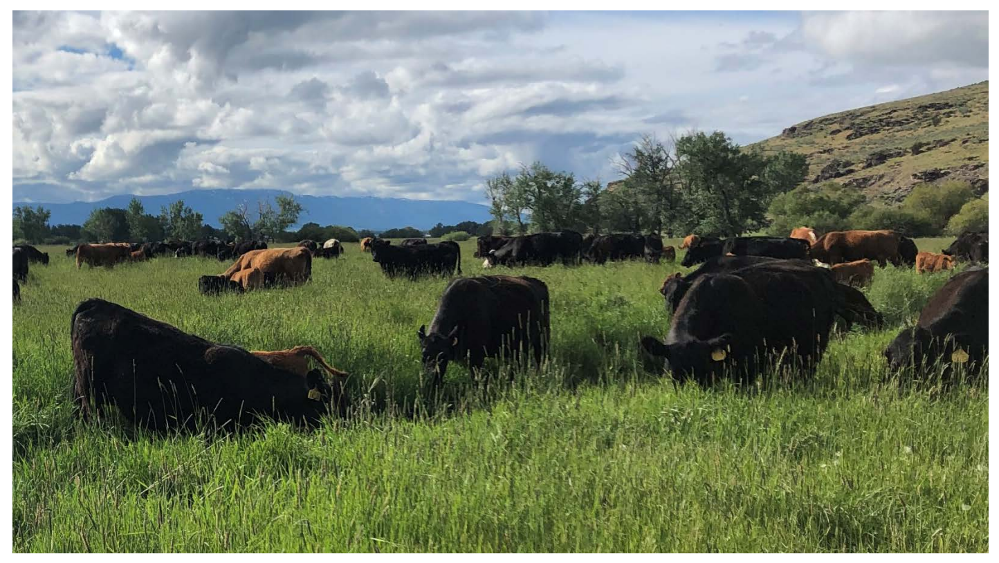
Buffalo Flats Planning Area

The USWCD and project partners are currently gathering information on the project site to determine the existing project opportunities and constraints. This has included communication with neighboring property owners and land managers to identify and understand the conditions. Project coordination, engineering designs, and environmental compliance will be the focus of work through at least 2021 as engineers and scientists with the BOR and other partner agencies assist the USWCD.