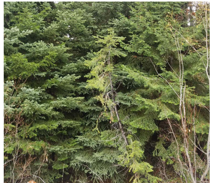
Proposed Thinning Area