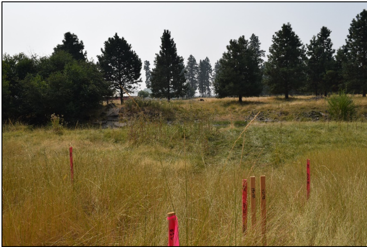
Dry Creek Pre Project