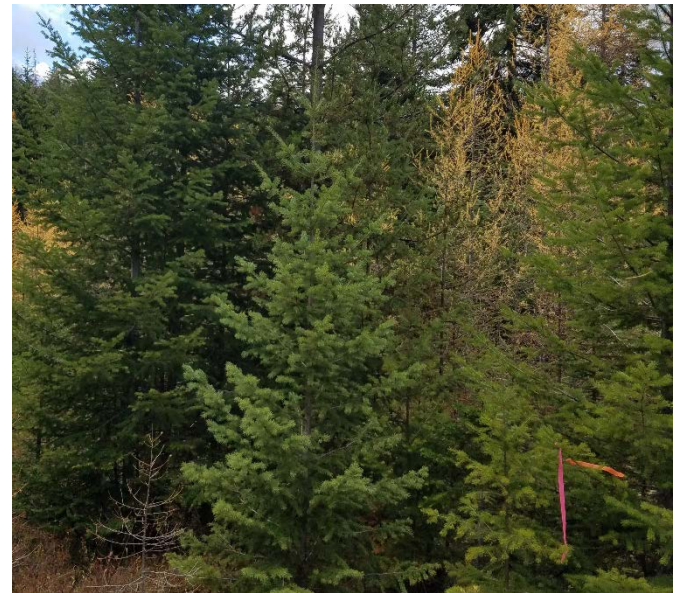
Proposed Thinning Area