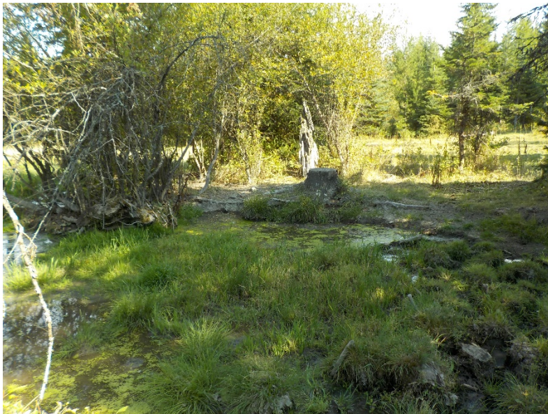
Proposed Spring to be Developed

Currently the District is working on a Spring Development and a Forest Thinning grant.