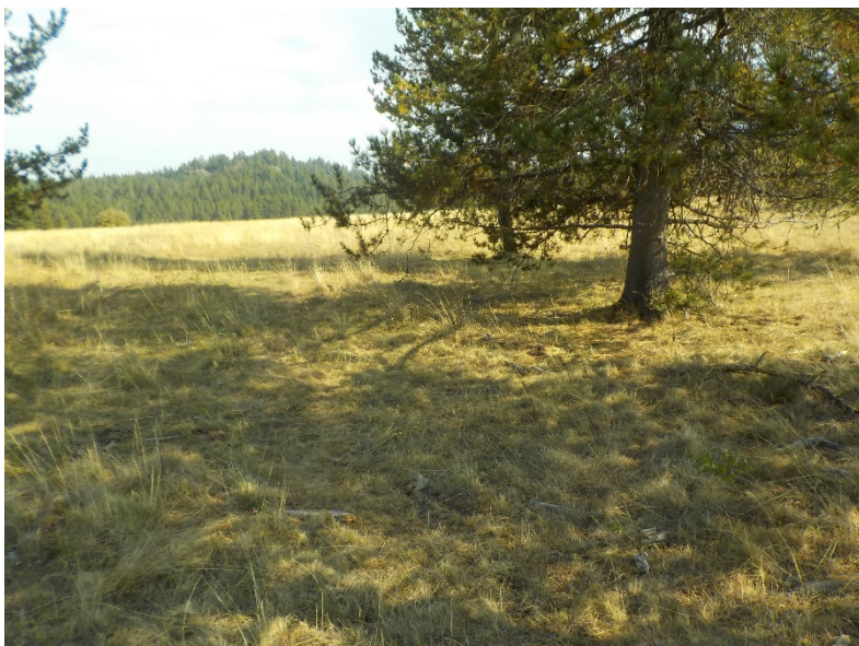
Proposed Trough Location