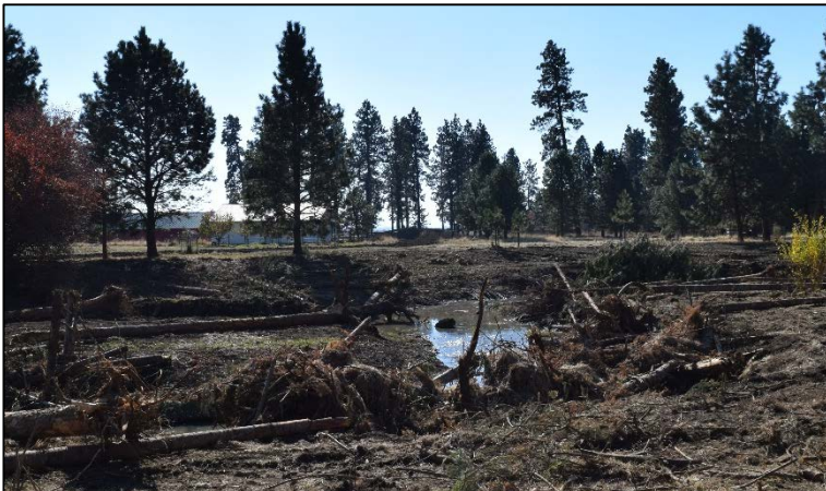
Dry Creek Post Project